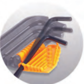
• With clip structure, L-keys are stored securely in the holder and also taken out easily.