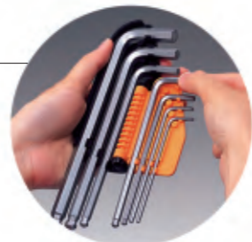
• Open outlets clip structure.