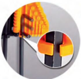
• Give pleasant outlook and secure function.